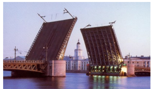
The Palace Bridge and Kunstkammer

For High School graduates who usually get their diplomas about June 21-22. From late May to early July nights are bright in St Petersburg, but the real White Nights normally last from June 11 to July 2. The nature of the White Nights (Beliye Nochi) can be explained by the geographical location of St. Petersburg. It is the world's most northern city with a population over 1 million. St Petersburg is located at 59 degrees 57' North (roughly on the same latitude as Oslo, Norway, the southern tip of Greenland and Seward, Alaska). Due to such a high latitude the sun does not go under the horizon deep enough for the sky to get dark. The dusk meets the dawn and it is so bright that in summer they do not turn street lighting on.