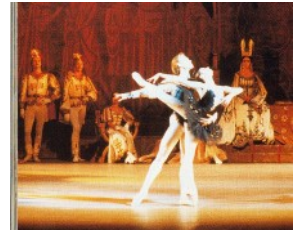
The Mariinsky Ballet

This Festival has become famous all over the world. Since 1993 it has become the event where the artistic aims of the performers met the demands of the artistic interests of the audience. The beauty of the White Nights, sung by Pushkin, creates the unique atmosphere of the Festival, where we can watch the brilliant acting of the best Russian and foreign actors and actresses. You can watch and listen to the masterpieces of the Russian and European composers: Tchaikovsky, Beethoven, Berlioz, Mozart, etc. Modern music is also presented at the Festival. Some musical fragments will be presented to the public for the first time in Russia.