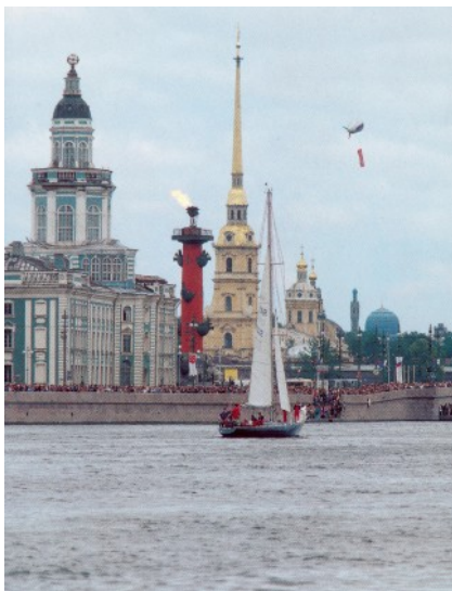
The Peter and Paul Fortress